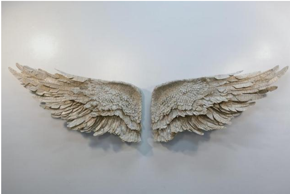
You Get Me Closer to God, No. 9