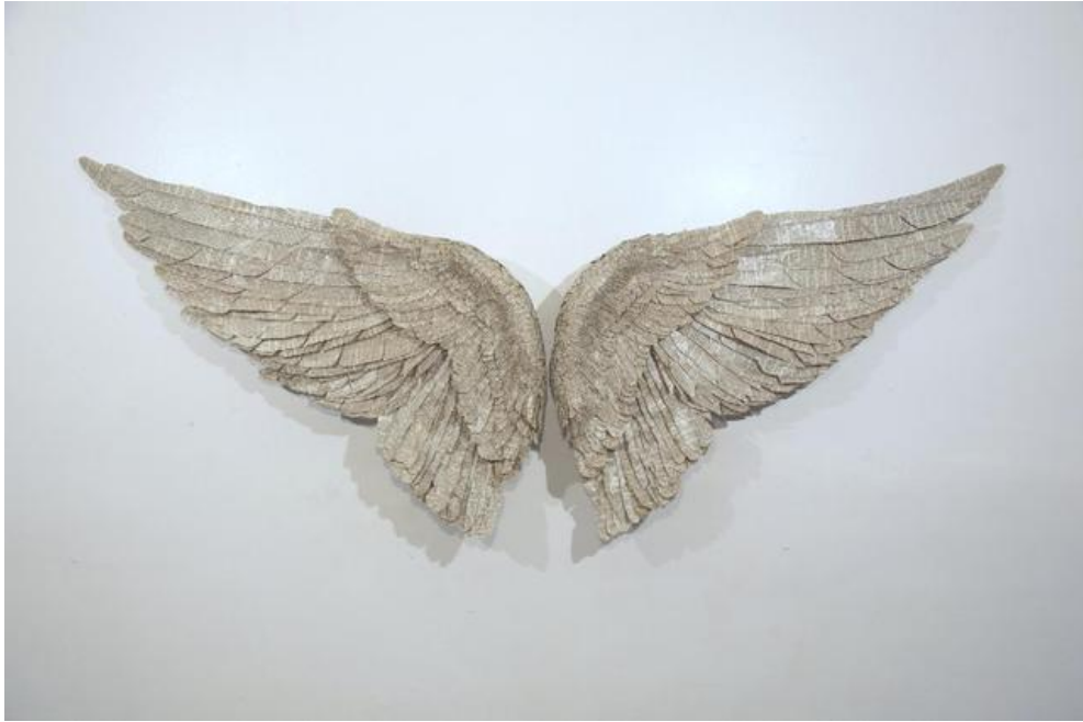
You Get Me Closer to God, No. 10