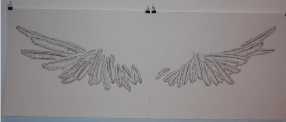
Deconstructed Wings #2, 2016