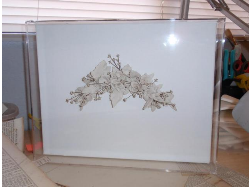
White Flowers 11, 2006