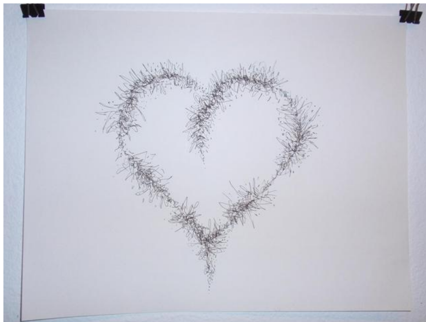
Delicate Heart, 2008