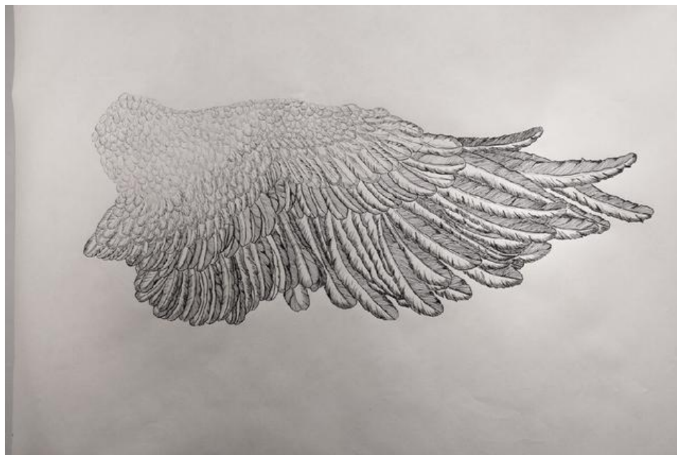
Promise of Flight #3, 2013