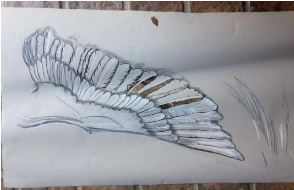
Promise of Flight #2, 2014 charcoal and watercolor on paper