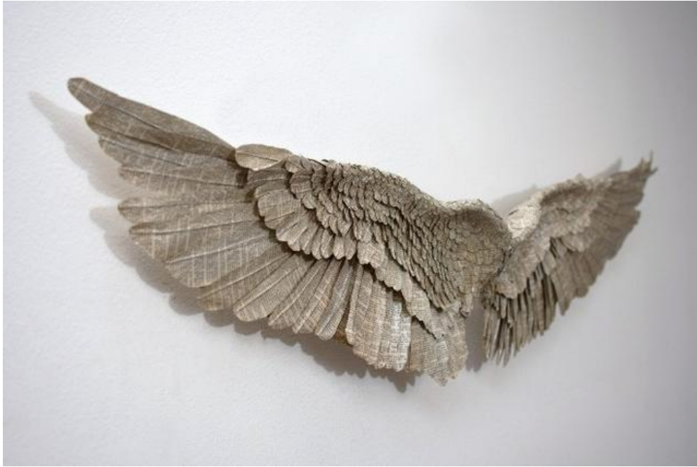
You Get Me Closer To God #11, 2015