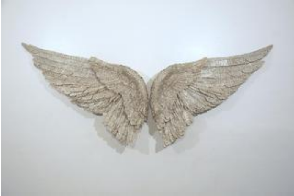
You Get Me Closer to God # 10 106 x 27 x 8 in. (269.24 x 68.58 x 20.32 cm)