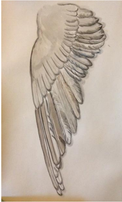
Promise of Flight #1 , 2014