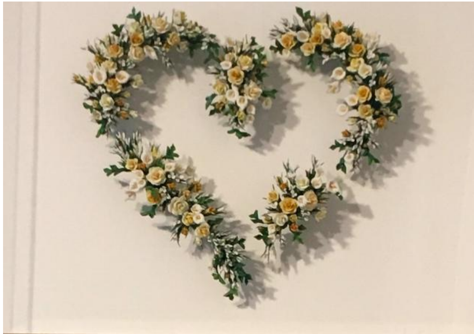
Yellows and Lillies