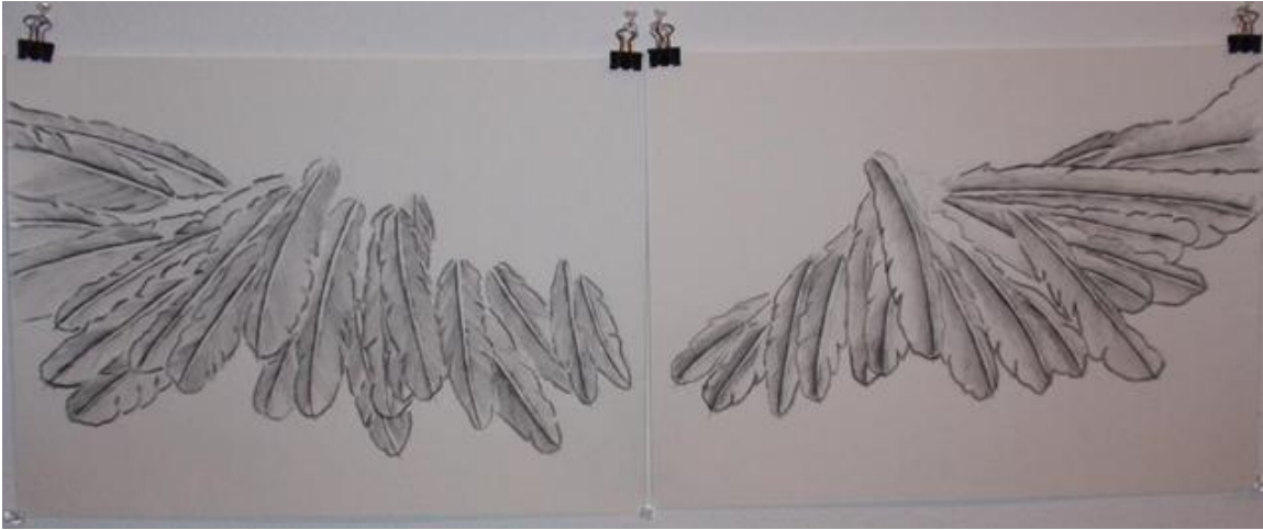
Deconstructed Wings #42, 2016