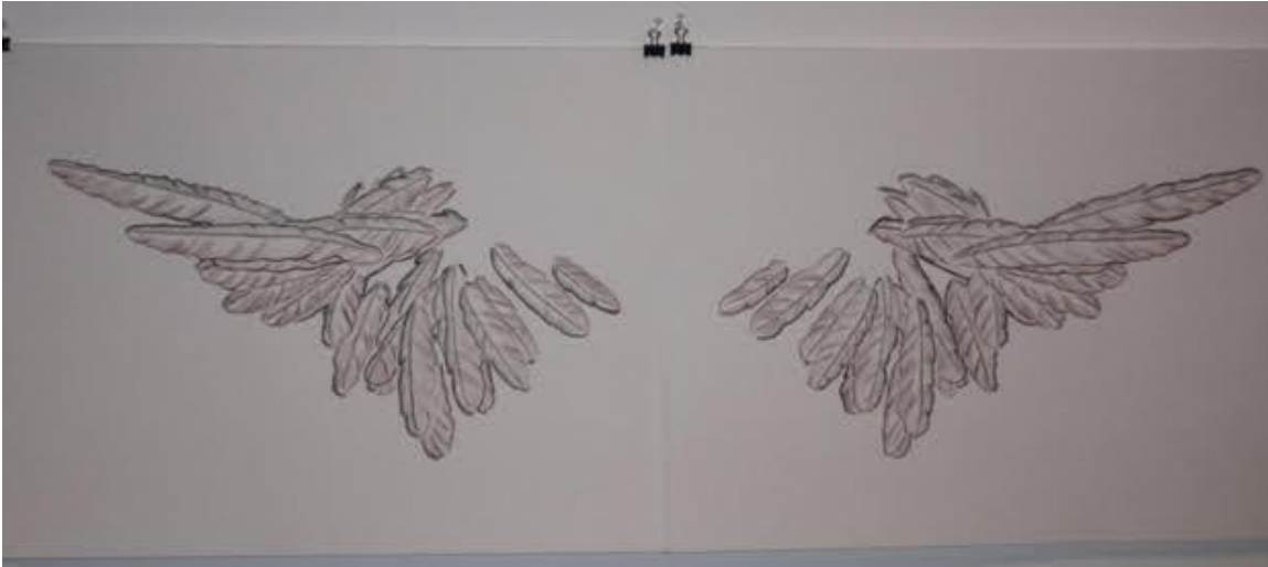
Deconstructed Wings #3, 2016