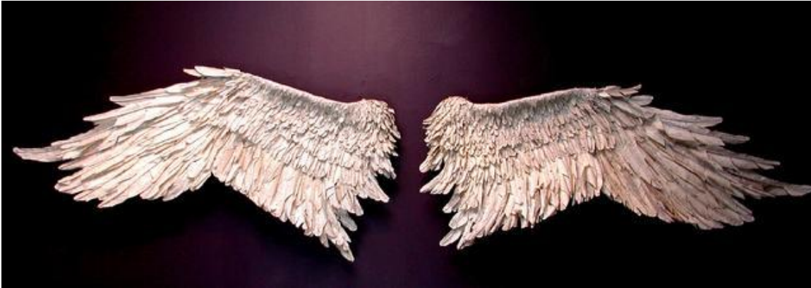
You Get Me Closer to God, No. 5, 2003