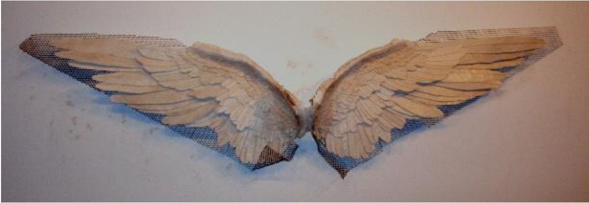
You Get Me Closer To God [Braille], 2016