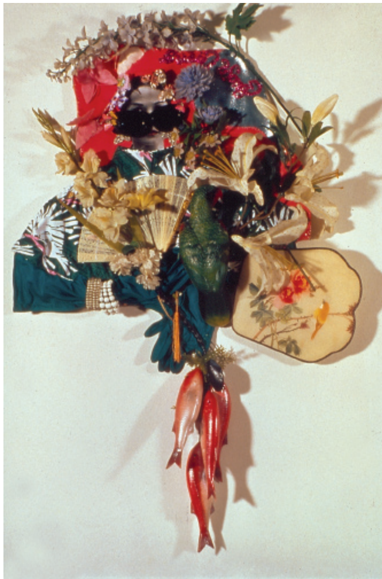
Nancy Kwan. 1976. Vinyl, collage, assemblage. 12 x 16 inches. Courtesy of the artist.